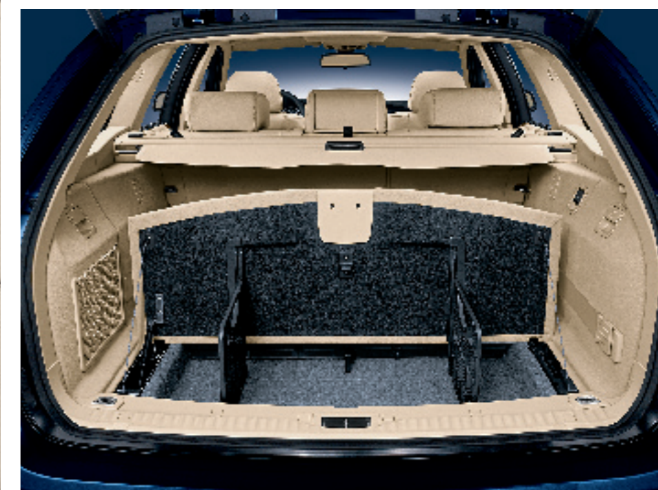
A storage compartment under the cargo floor features adjustable dividers that can form different-sized compartments.