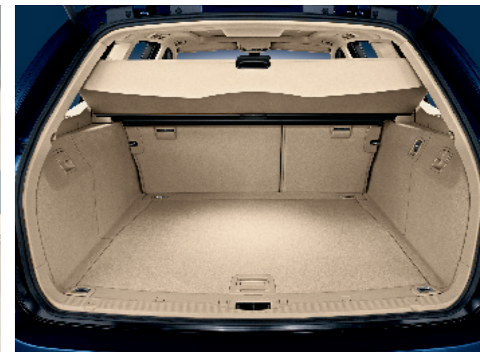
The cargo area cover tilts up whenever the tailgate or rear window is opened.